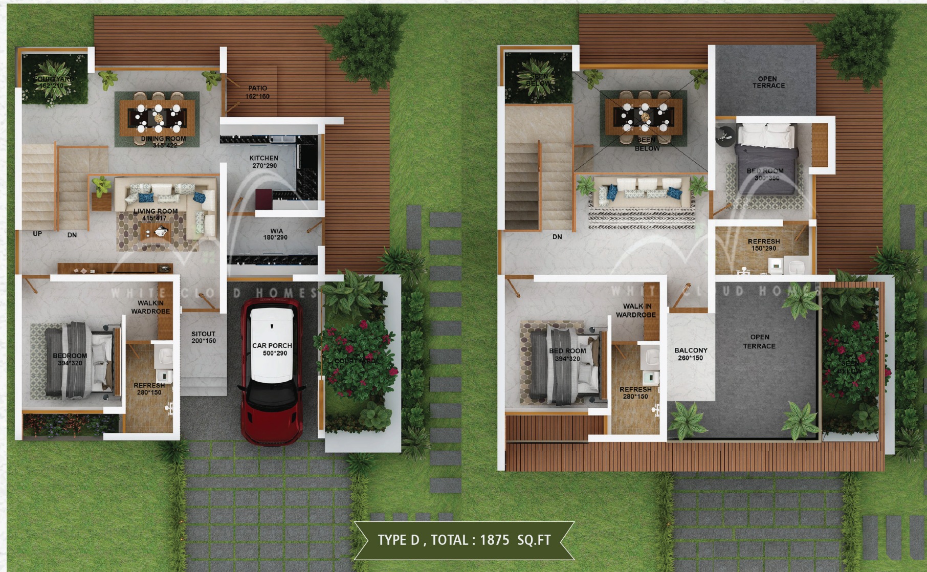
Ground Floor : 1150 sq.ft