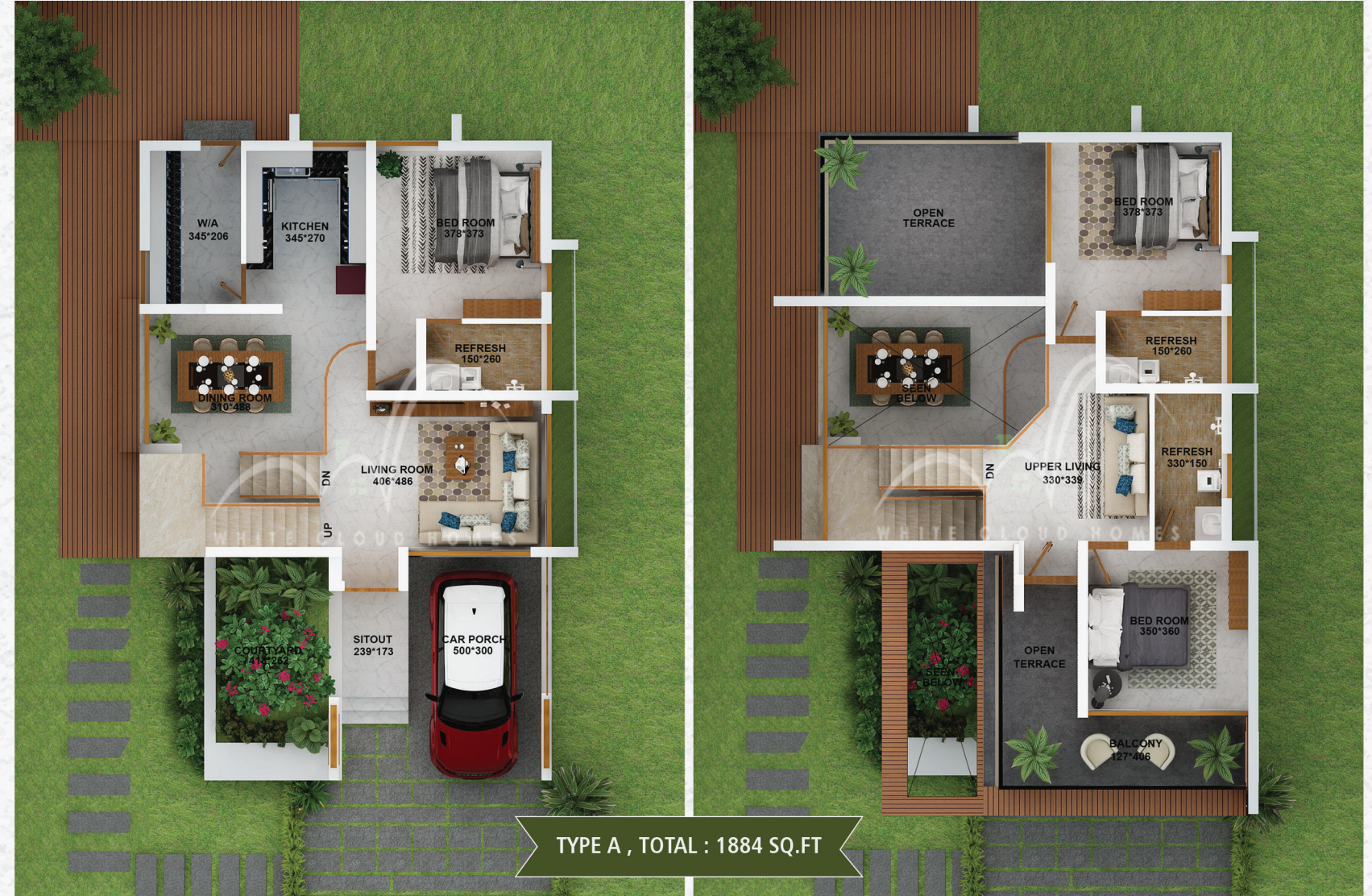
Ground Floor : 1153 sq.ft