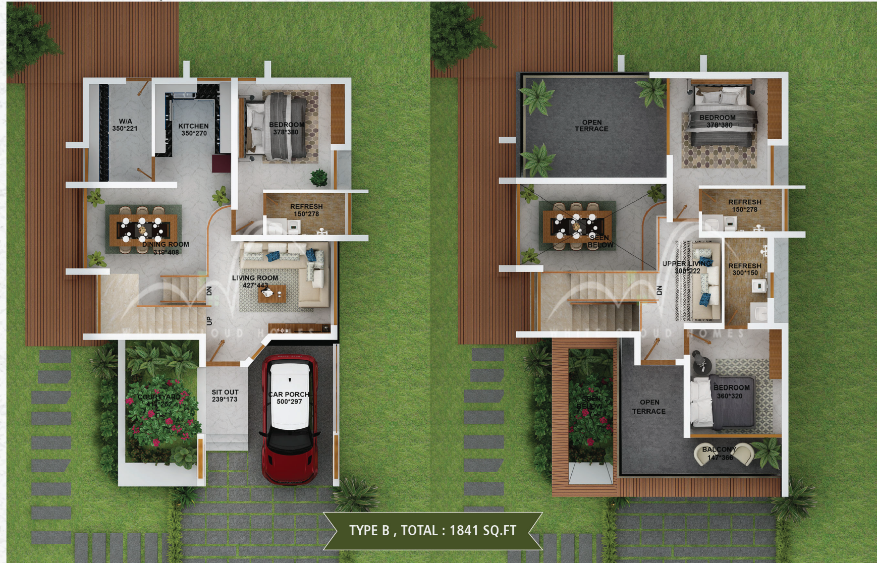
Ground Floor : 1150 sq.ft