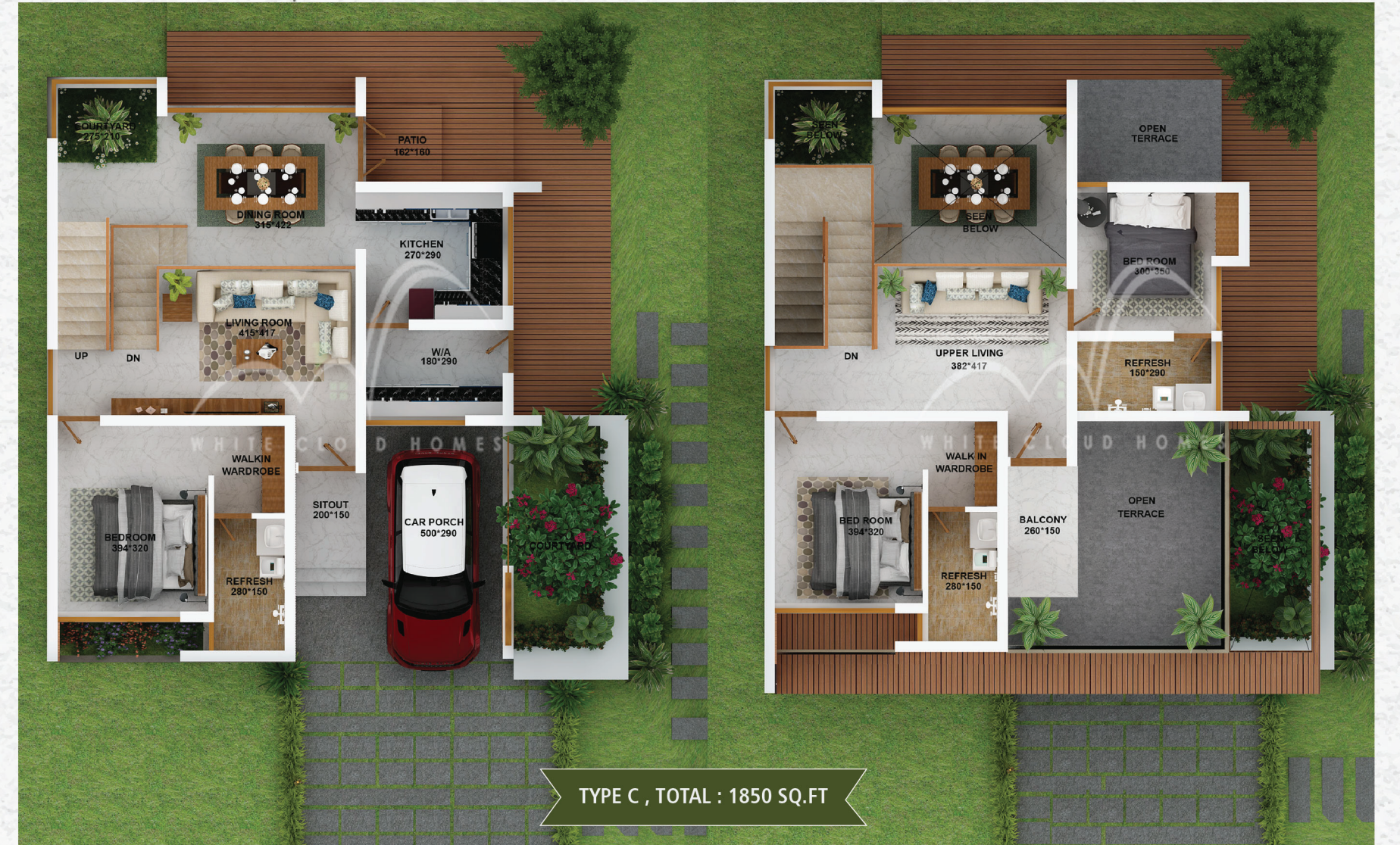
Ground Floor : 1125 sq.ft